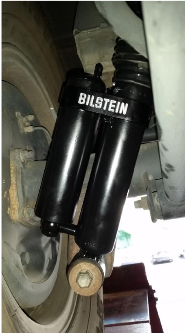
Figure 2 – RIGHT REAR (looking towards the rear)