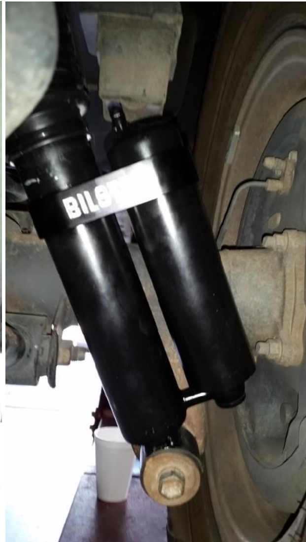
Figure 3 – LEFT REAR (looking towards the rear)

Note: The shocks depicted herein differ slightly in appearance from the supplied components.